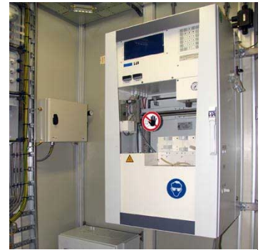
Quick-TOC fast process TOC-analyzer