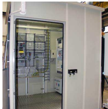
The power distribution panel is built to customers specifications