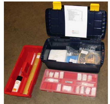
A laminated list with parts description and part order numbers.