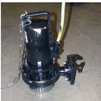
Submersible heavy duty waste water pump