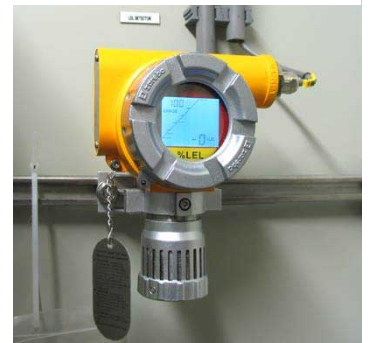
%LEL (Lower Explosive Limit) gas detector