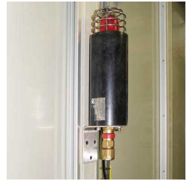
Beacon (flashing type)