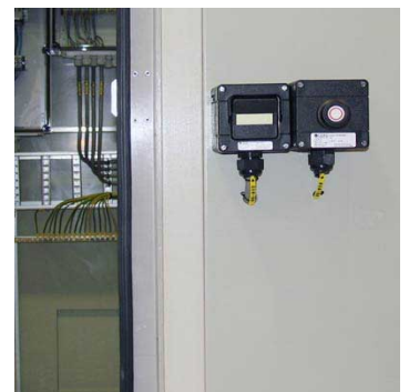
Main switch with alarm reset button outside near door entrance