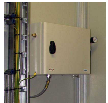
The Zero Air Generator delivers CO 2 -free instrument air