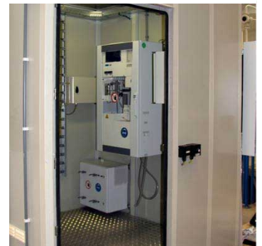
TOC-analyzer and reagent box