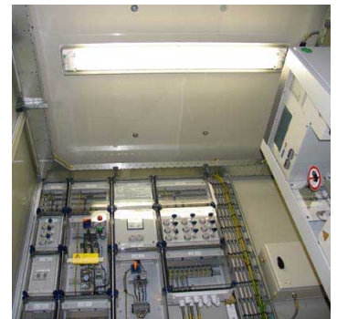
The illuminance level is > 800 lux, enough to work safely