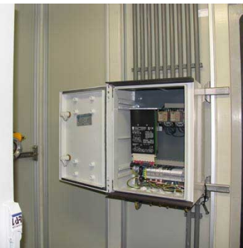
Junction Box with 24 V DC power supply and terminals