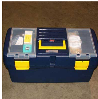
Spare Parts are delivered in a special service kit